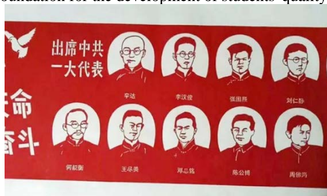
Figure 3 Wuhan red classics

and lay a solid cultural foundation for the development of students' quality.