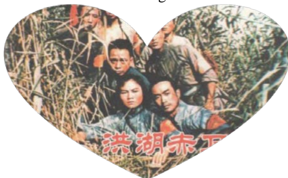
Figure 2 Honghu Red Guard

In addition to historical and cultural resources, there are abundant red resources in Hubei, which provide a guarantee for the development of ideological and political teaching. In terms of time, the red resources of Hubei Province run through the modern history of China, from the Revolution of 1911 to the early days of the founding of New China, has been a center of revolution and combat in Hubei. Nowadays, the cultural resources of Hubei are all over Wuhan and twelve prefecture-level cities. And from the red classic characters, Hubei also gave birth to five "one big" representatives, as well as two national presidents, respectively, Dong Biwu, Li Xiannian. Among the classic works of red literature and art, hubei also has well-known works, including "advance into the central plains ", " honghu water, long wave ", " honghu red guard" and other classic works, leaving a valuable red spiritual and cultural wealth for the contemporary people. These contents are cited in the ideological and political education of colleges and universities, which is bound to become the winning weapon for students to correct their thinking and firm their determination [2].